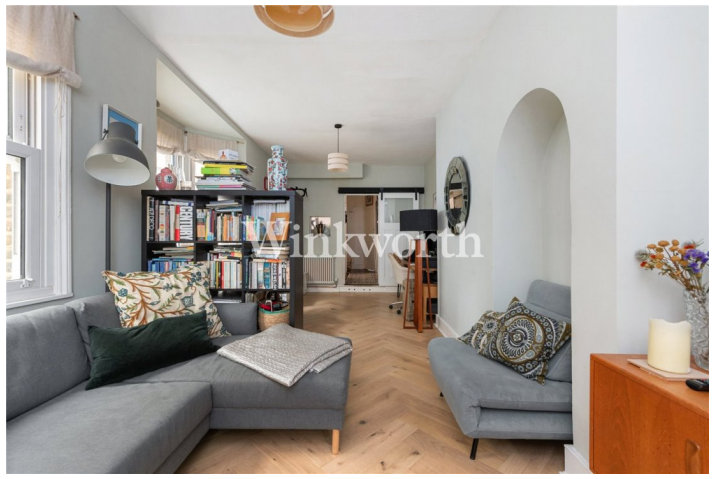
BRUCE GROVE, HARINGEY, N17 £360,000 LEASEHOLD