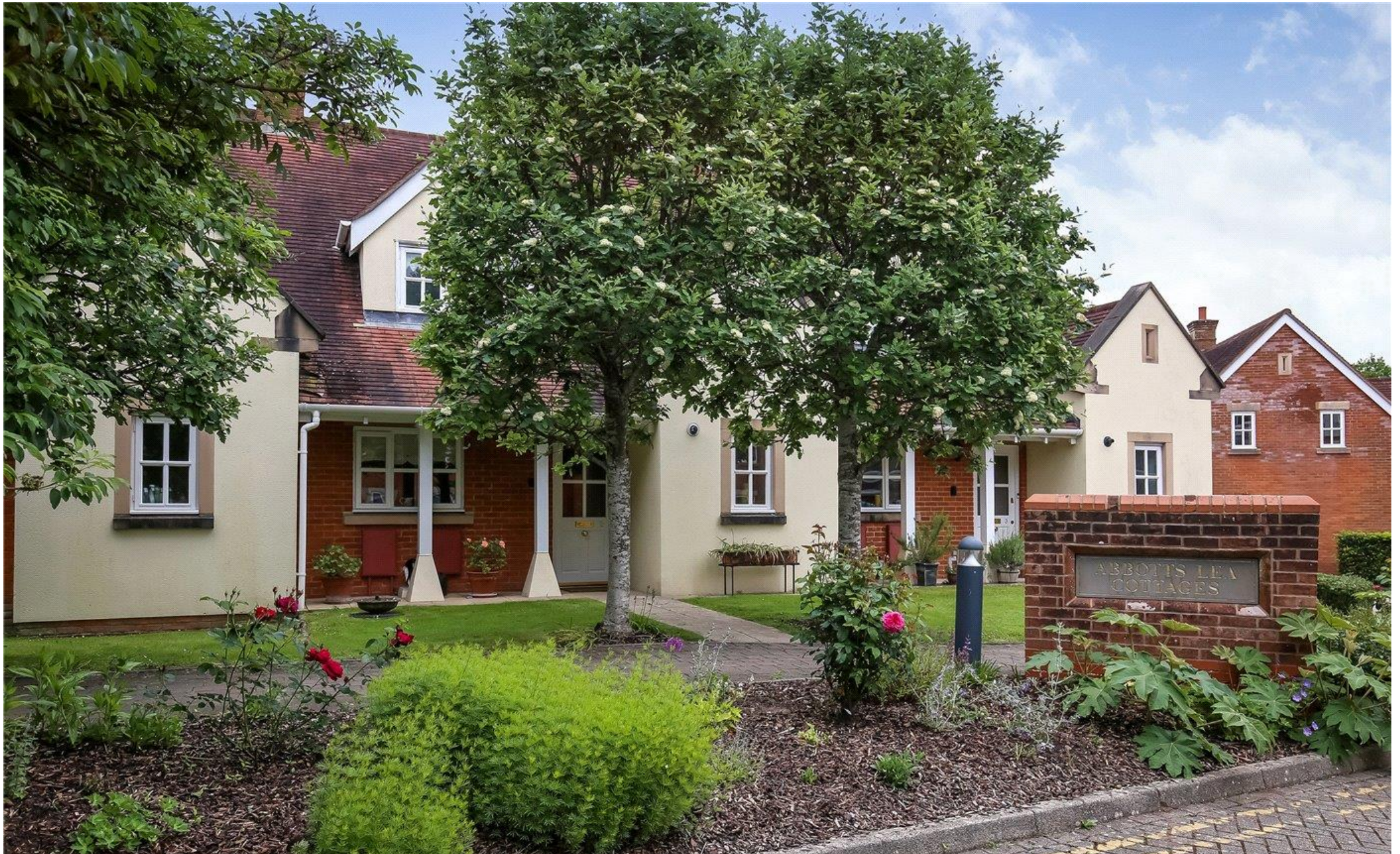
Abbotts Lea Cottages, Worthy Road, Winchester, SO23 7HB