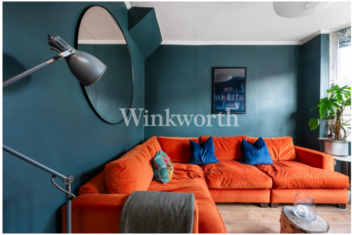
SHOBDEN ROAD, N17 £475,000 FREEHOLD