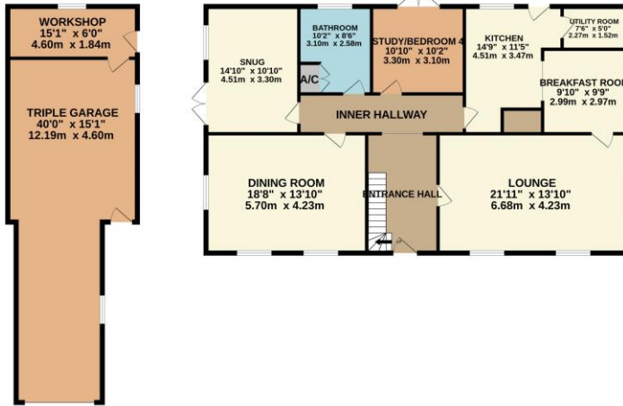
GROUND FLOOR 1991 sq.ft. (185.0 sq.m.) approx.