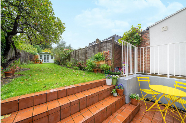
DUNSTANS ROAD, EAST DULWICH, LONDON, SE22 OIEO £600,000 SHARE OF FREEHOLD