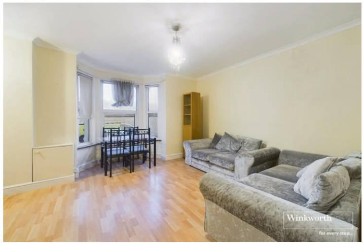
FLORENCE STREET, HENDON, LONDON, NW4 £499,950 FREEHOLD