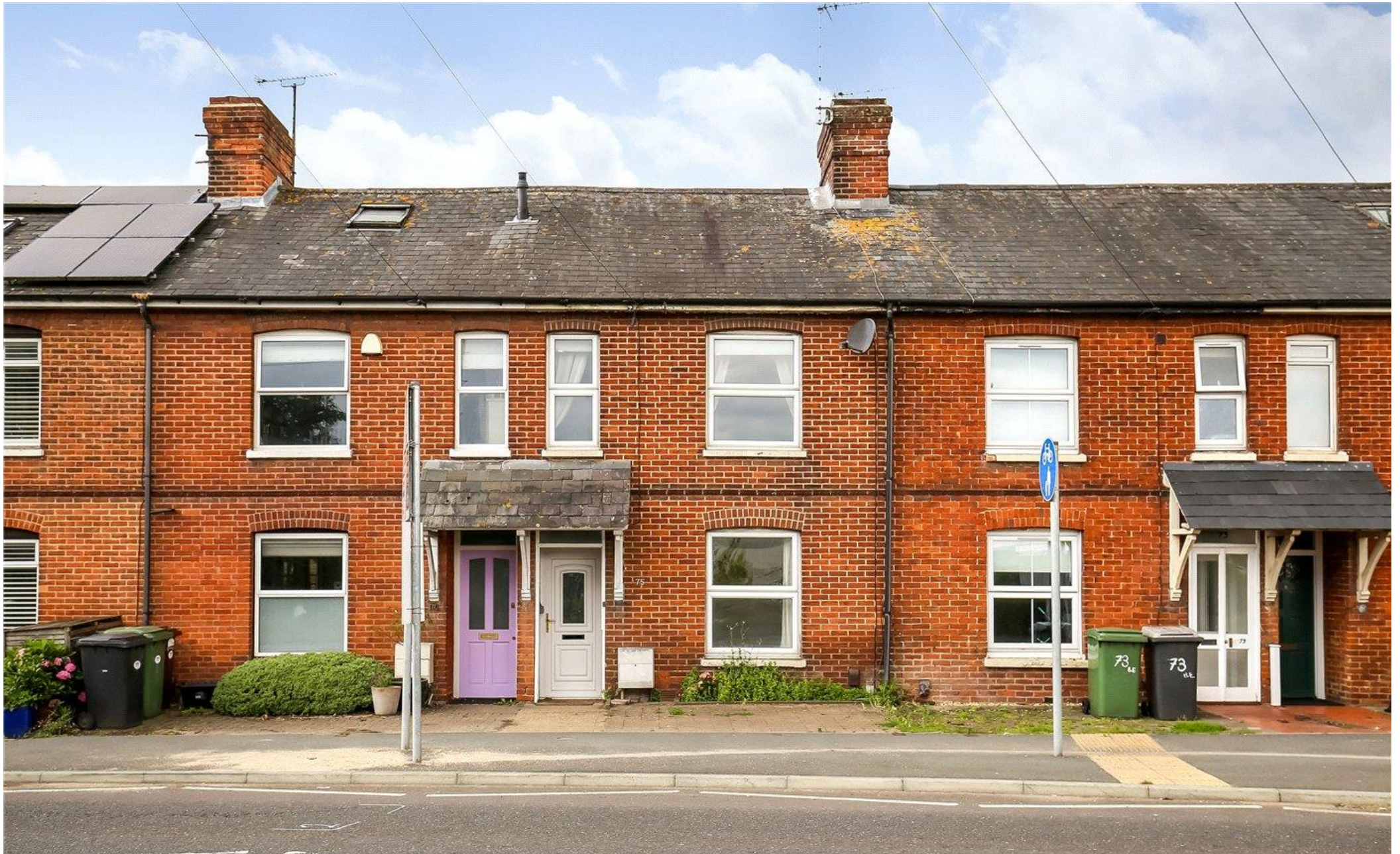
Bar End Road, Winchester, Hampshire, SO23 9NP