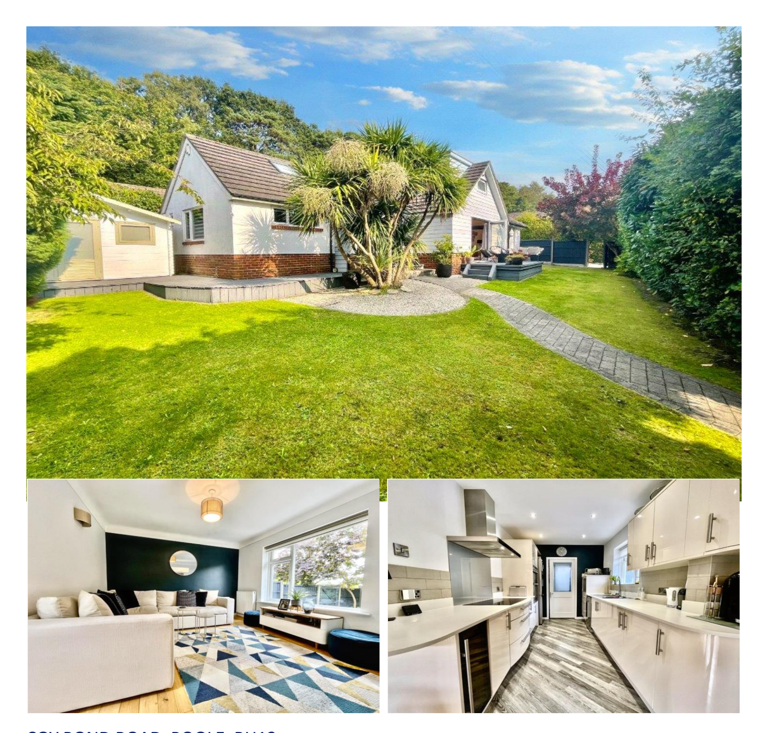
COY POND ROAD, POOLE, BH12