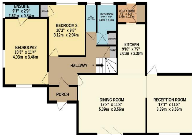
GROUND FLOOR 918 sq.ft. (85.3 sq.m.) approx.