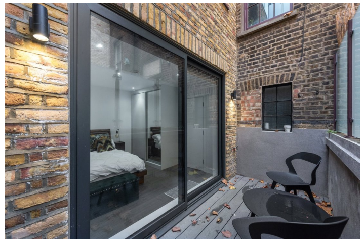
COMMERCIAL STREET, LONDON, E1 £2,400 PER MONTH