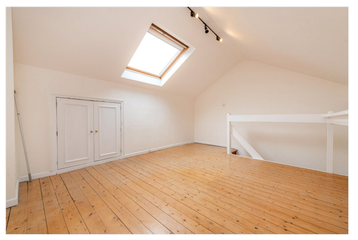
WESLEY SQUARE, LONDON, W11 £550 PER WEEK