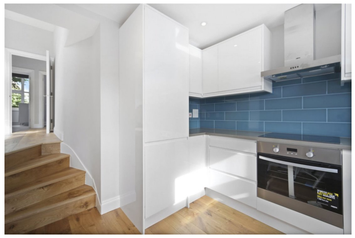
LOFTUS ROAD, LONDON, W12