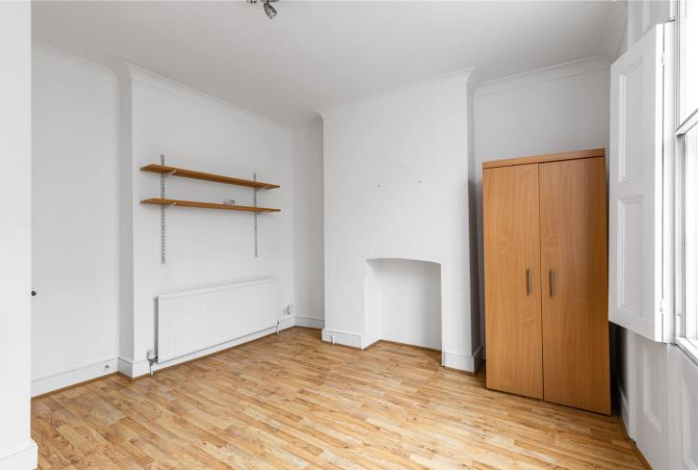
NEW NORTH ROAD, ISLINGTON, LONDON, N1 £350 PER WEEK PART FURNISHED