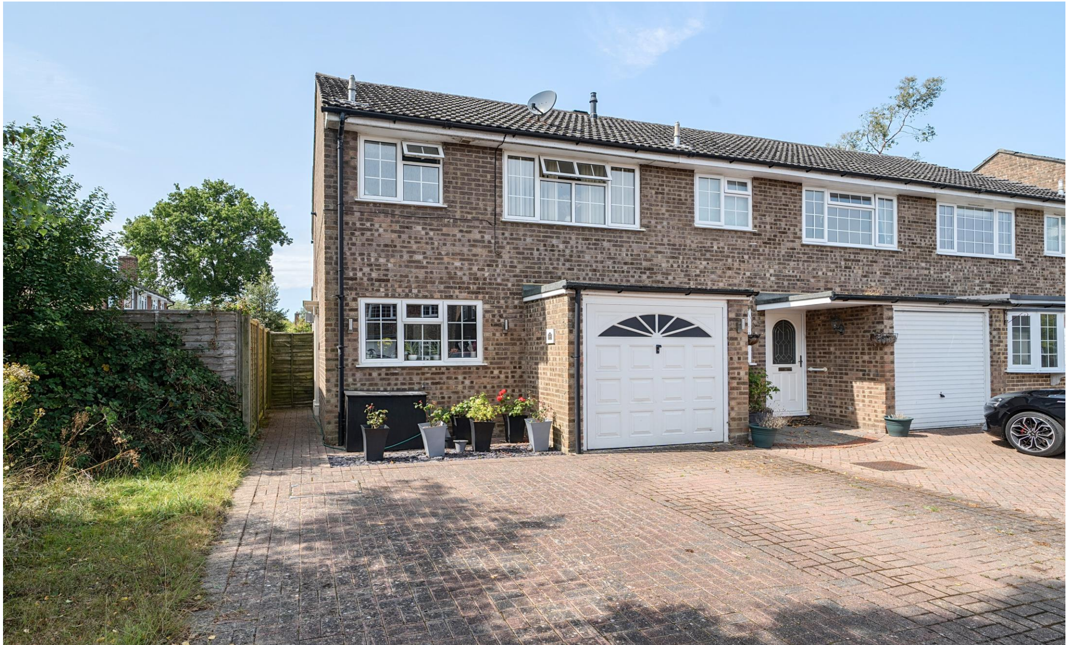
Jubilee Close Pamber Heath Hampshire RG26 3HP