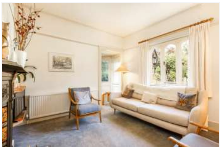
HOLLY VILLAGE, HIGHGATE, LONDON, N6 OFFERS IN EXCESS OF £3,000,000 FREEHOLD

AN ENCHANTING THREE BEDROOM, GRADE 2 LISTED DETACHED HOUSE SET IN AN EXTRAORDINARY, PRIVATE ENCLAVE OF VICTORIAN GOTHIC HOUSES.