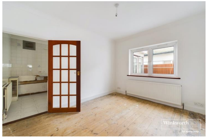
GLENWOOD AVENUE, KINGSBURY, LONDON, NW9 OFFERS OVER £650,000 FREEHOLD