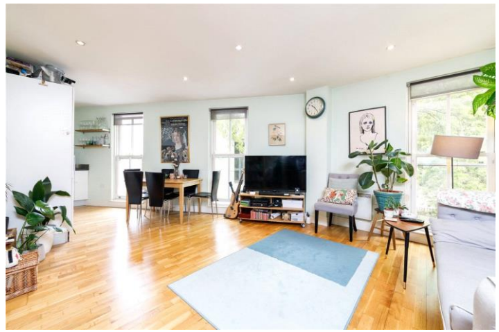
KINGSLAND PASSAGE, LONDON, E8 £460,000 LEASEHOLD