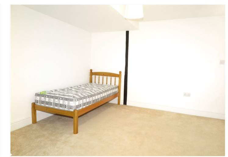
West Street, Surrey, GU9