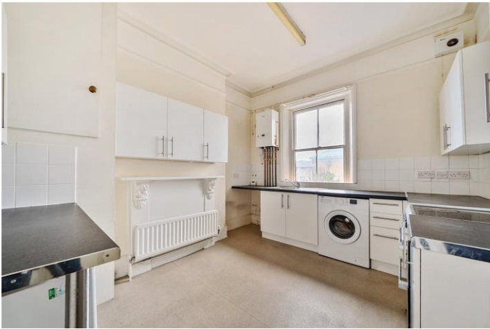
SYDENHAM ROAD, LONDON, SE26 £450,000 - £500,000 LEASEHOLD

Discover this generously sized four-bedroom flat offering 1439 sqft of internal space, ideally situated above a shop on the bustling Sydenham Road, SE26.