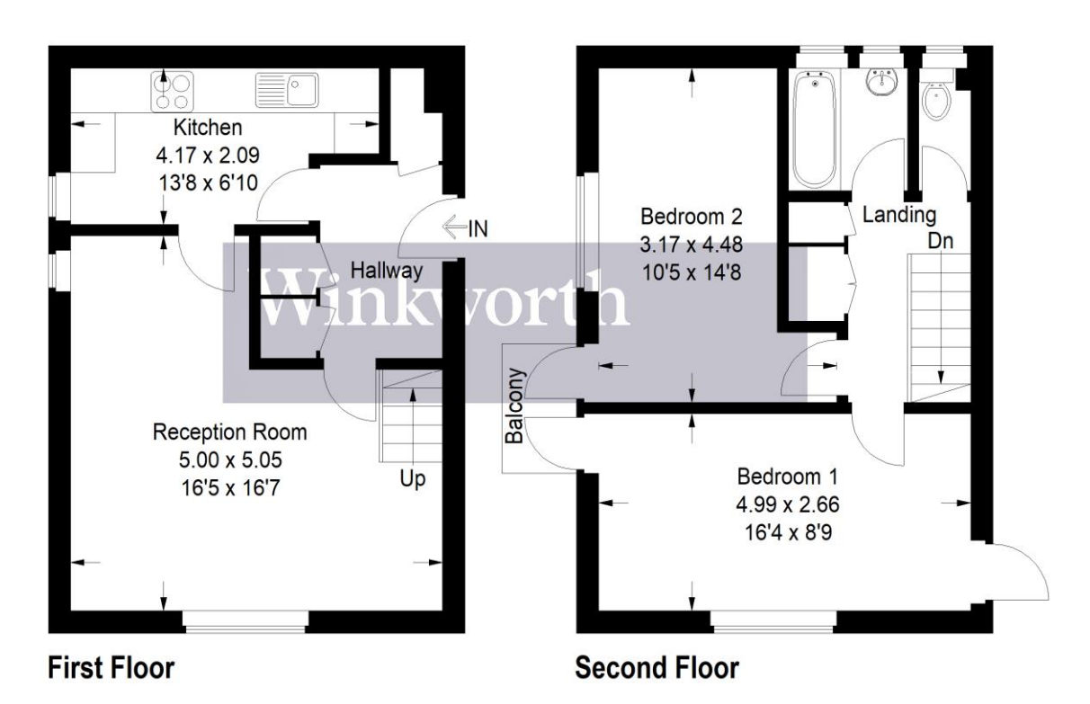
Illustration for identification purposes only, measurements are approximate, not to scale. Winkworth © 2019 (ID 511011)

This floorplan is for illustration purposes only and is not to scale. The position and size of doors, windows, appliances and other features are approximate.