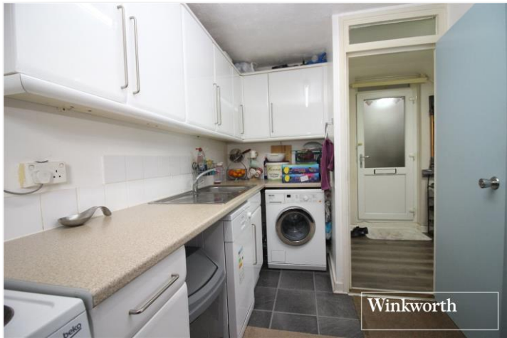
WATLING COURT, ELSTREE, BOREHAMWOOD, WD6 £325,000 LEASEHOLD

TWO DOUBLE BEDROOM DUPLEX MAISONETTE WITH SECURE PARKING IN THE HEART OF ELSTREE.