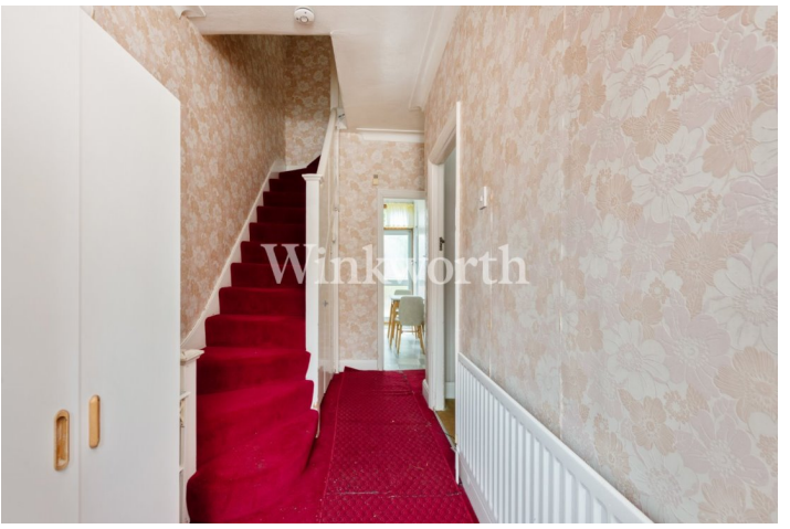
LORDSHIP LANE, HARINGEY, N17 £500,000 FREEHOLD