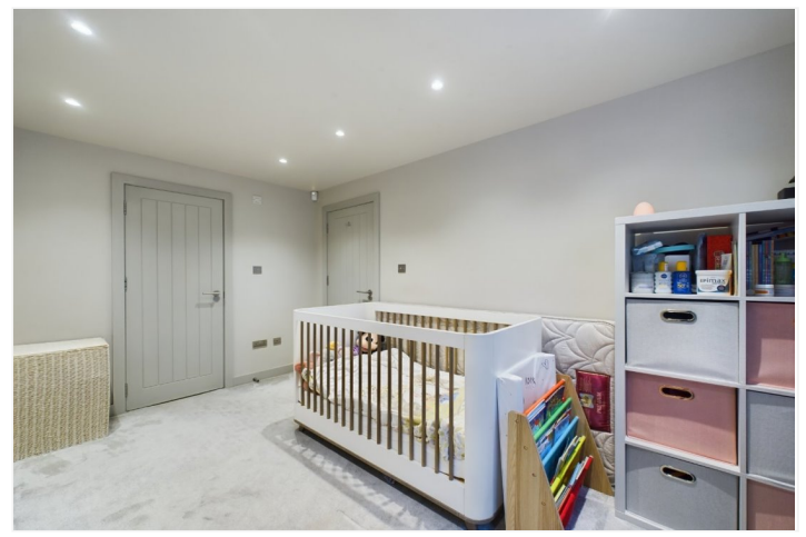
BROOKLAND RISE, HAMPSTEAD GARDEN SUBURB, NW11 £595,000 LEASEHOLD