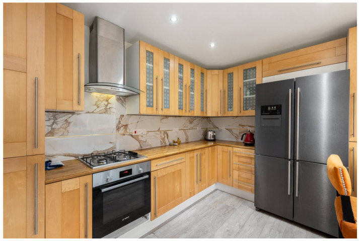
DEVONSHIRE HALL, FRAMPTON PARK ROAD, LONDON, E9 £585,000 LEASEHOLD