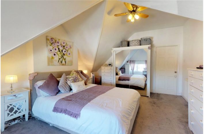
BURNABY ROAD, BOURNEMOUTH, DORSET, BH4