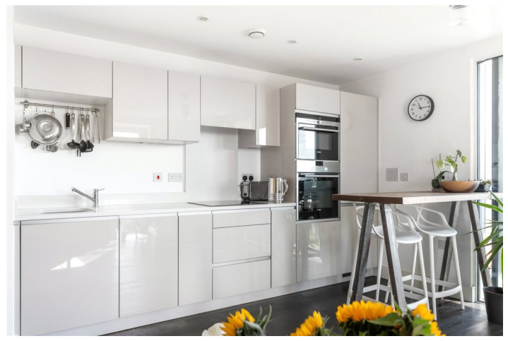
SLEDGE TOWER, DALSTON SQUARE, LONDON, E8 'OFFERS IN EXCESS OF' £475,000 LEASEHOLD