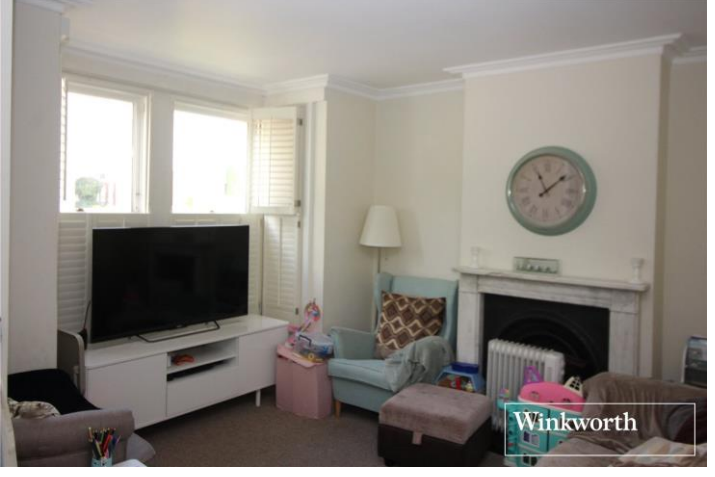
CLARENDON ROAD, HERTFORDSHIRE, WD6 £465,000 FREEHOLD