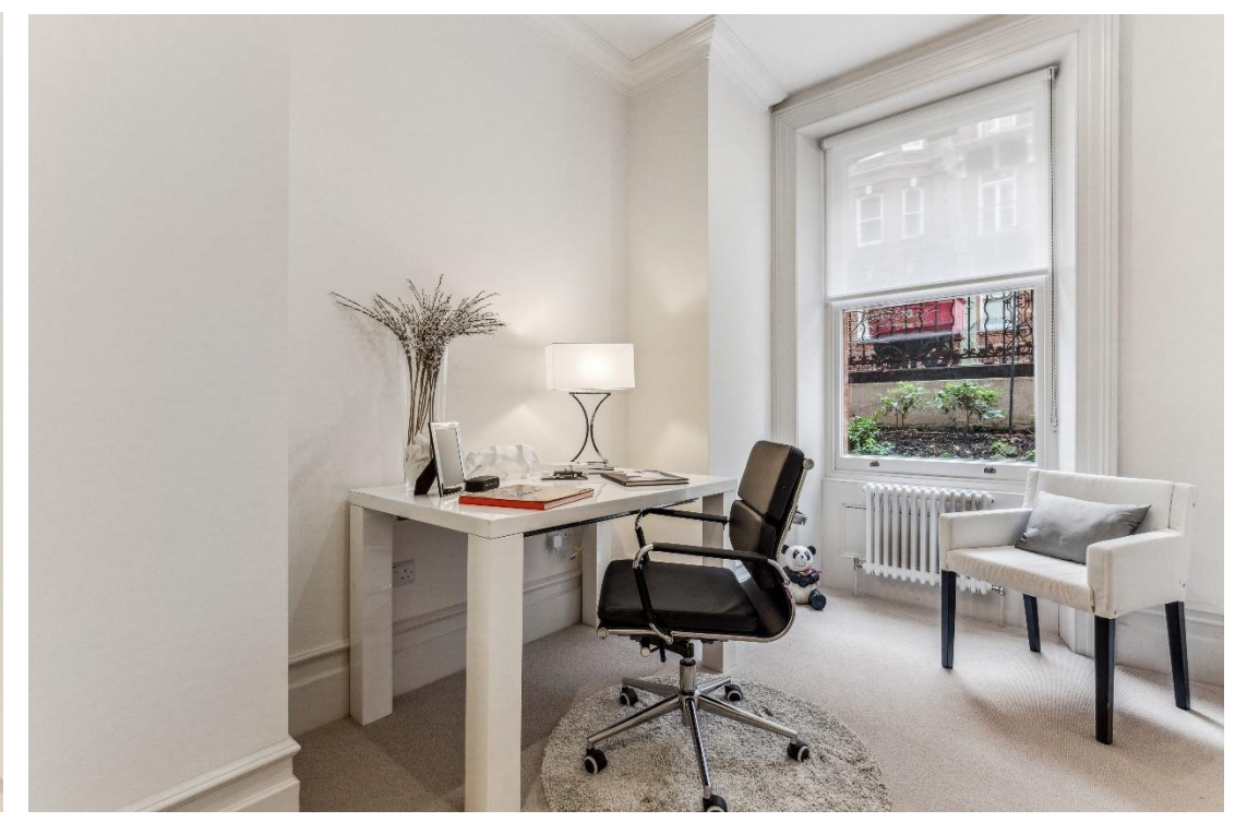
Newly Refurbished | Communal Gardens | Share of Freehold