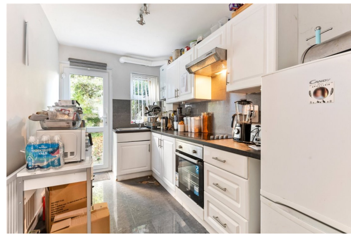
WESTBOURNE DRIVE, LONDON, SE23 £325,000 LEASEHOLD

A unique opportunity to purchase this charming one-bedroom ground-floor flat on Westbourne Drive which offers both comfort and convenience.