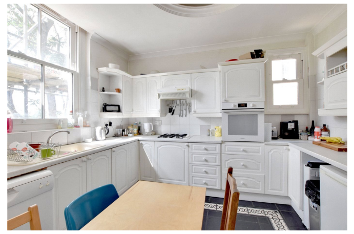
GRANVILLE PARK, LEWISHAM, SE13 7DW £450,000

A LARGE TWO DOUBLE BEDROOM PERIOD CONVERSION FOUND ON THE FIRST FLOOR OF THIS IMPRESSIVE FOUR STOREY VICTORIAN HOUSE WITH A COMMUNAL GARDEN AND LOCATED CLOSE TO THE HEATH AND LEWISHAM STATION AND DLR.