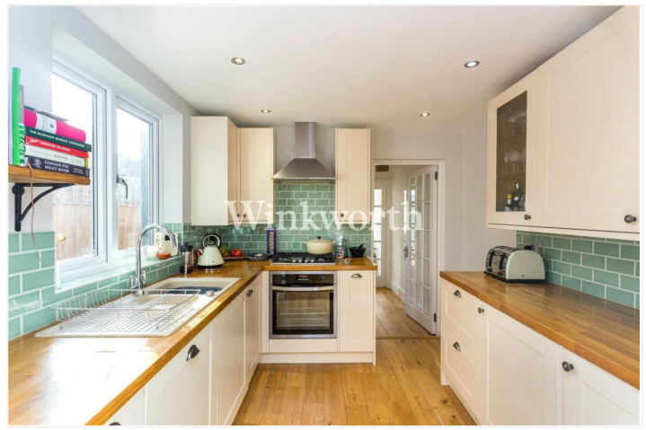
EVESHAM ROAD, N11 £825,000 FREEHOLD

AN ATTRACTIVE FOUR-BEDROOM PERIOD HOUSE WITH A LIGHT, SPACIOUS INTERIOR AND A SOUTH-FACING REAR GARDEN, CONVENIENTLY LOCATED FOR PUBLIC TRANSPORT LINKS INTO THE CITY AND WEST END.