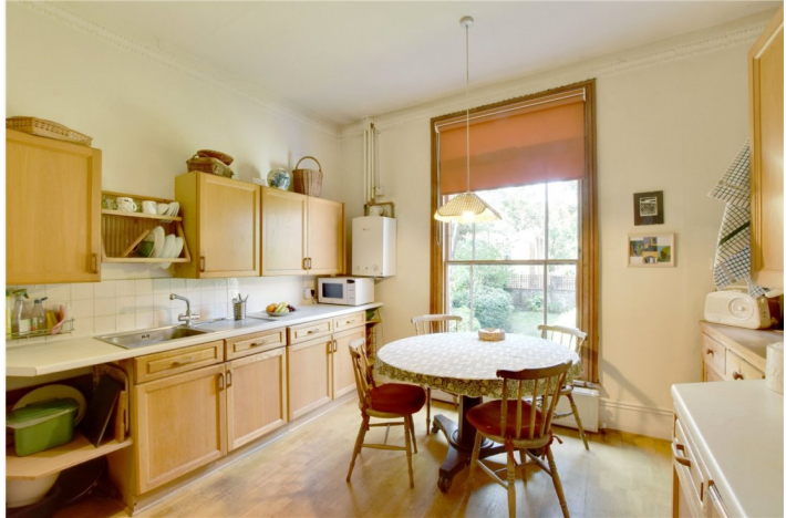
EGERTON DRIVE, GREENWICH, LONDON, SE10 £1,250,000 FREEHOLD

A STUNNING VICTORIAN SEMI-DETACHED FAMILY HOUSE, THAT IS PERFECTLY NESTLED IN THE HEART OF THE ASHBURNHAM TRIANGLE IN WEST GREENWICH. MEASURING C1556 SQ FT AND FEATURING A LARGE WEST FACING PRIVATE GARDEN.