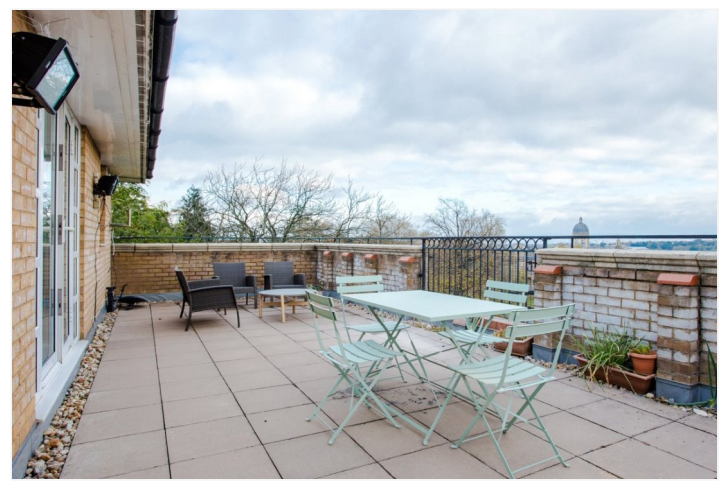
SPARKFORD GARDENS, LONDON, N11 OFFERS IN EXCESS OF £600,000 LEASEHOLD