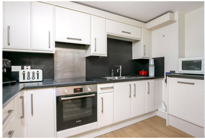
BOOKBINDERS COURT, CUDWORTH STREET, LONDON, E1 £500,000 LEASEHOLD