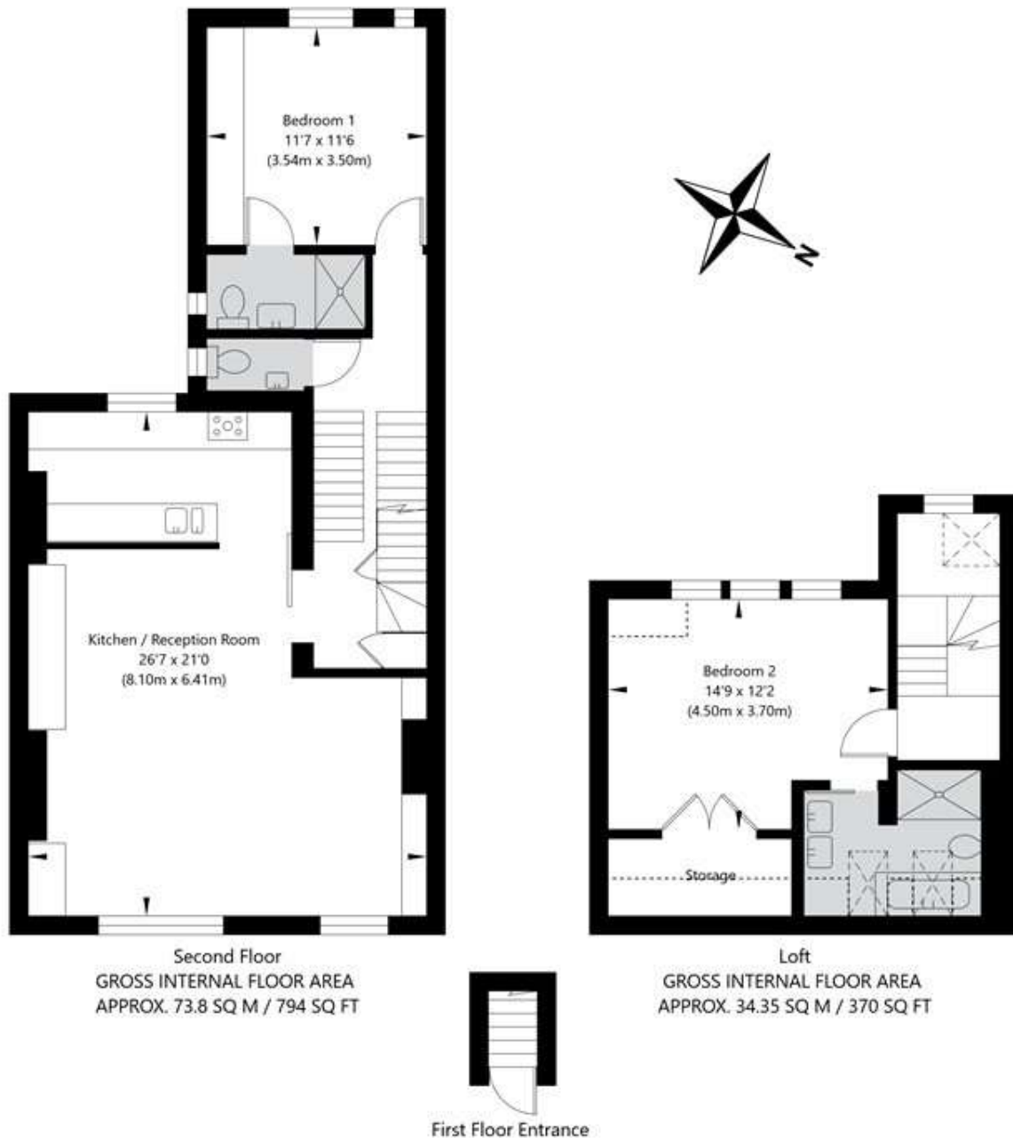
Second Floor GROSS INTERNAL FLOOR AREA APPROX. 73.8 SQ M / 794 SQ FT