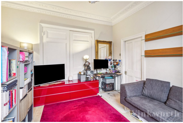
OCKENDON ROAD, LONDON, N1 £1,750,000 FREEHOLD