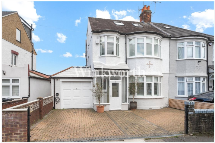
WENTWORTH GARDENS, N13 £875,000 FREEHOLD

STUNNING SEMI-DETACHED FAMILY HOME WITH CONTEMPORARY OPEN-PLAN LIVING, LOFT CONVERSION, IN A POPULAR LOCATION NEAR PARKS AND AMENITIES.