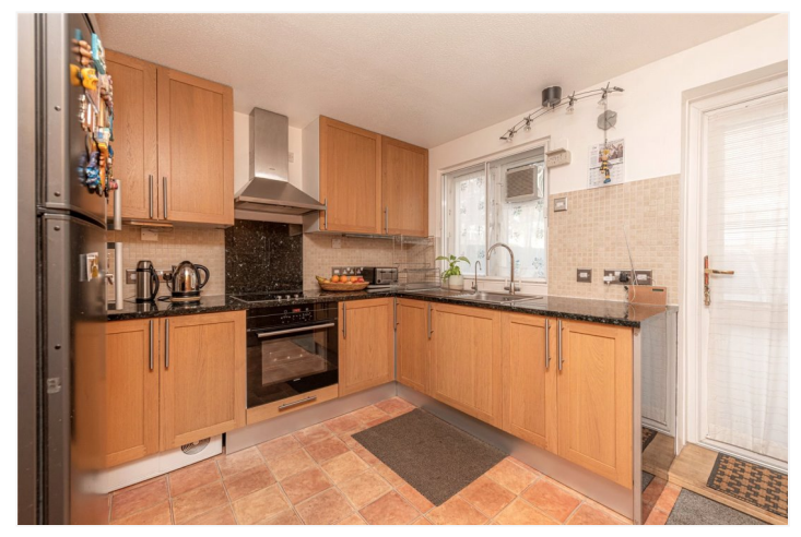
CHARLOTTE MEWS, W10 £620,000 LEASEHOLD