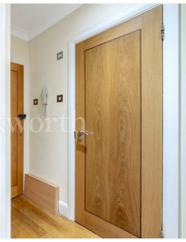
GOLDERS GREEN CRESCENT, GOLDERS GREEN, LONDON, NW11 £310,000 LEASEHOLD