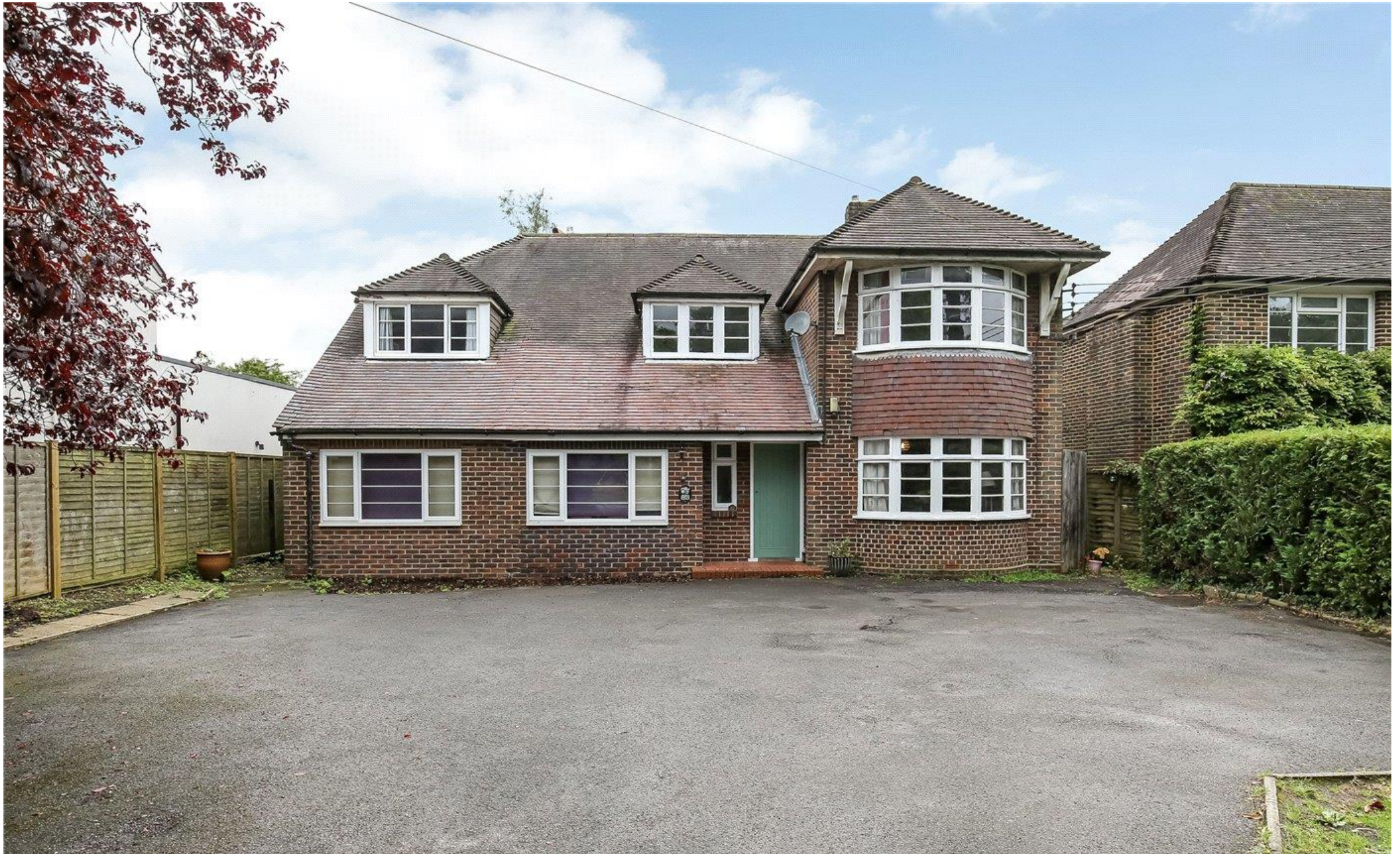
Oliver's Battery Road South, Winchester, Hampshire, SO22 4JQ