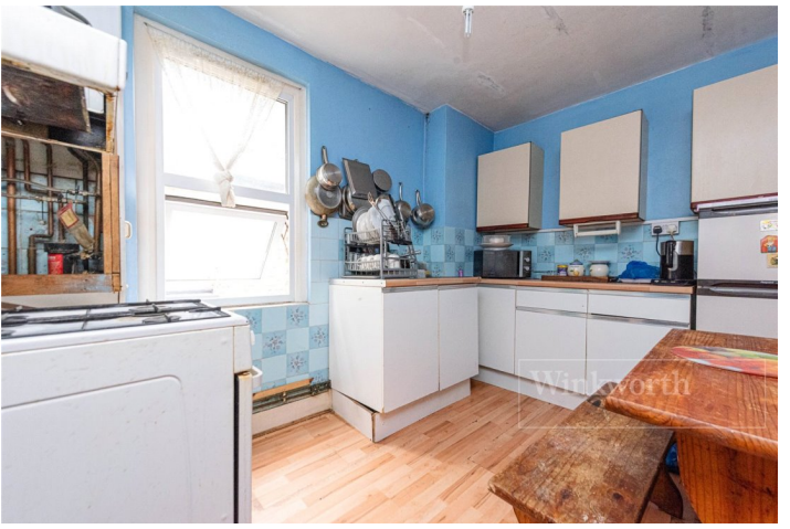
PURVES ROAD, LONDON, NW10 £1,200,000 FREEHOLD

A SUPERB OPPORTUNITY TO BUY AND RENOVATE THIS VICTORIAN PERIOD FAMILY HOME IDEALLY LOCATED ON PURVES ROAD, RIGHT IN THE HEART OF KENSAL RISE.