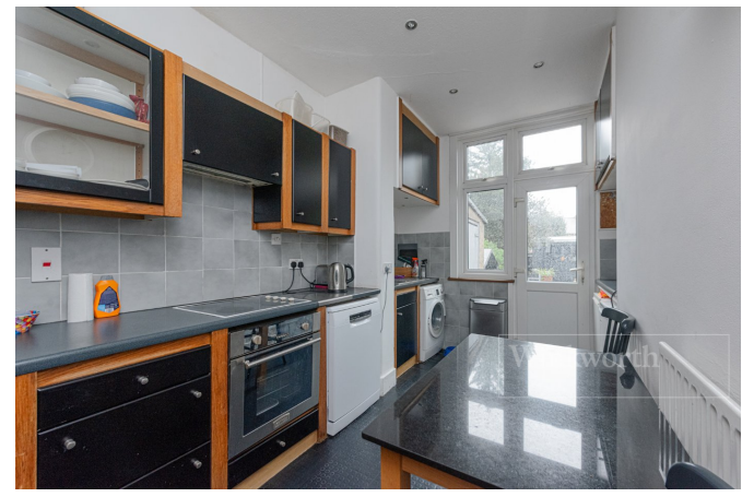
PARK PARADE, LONDON, NW10 £699,950 FREEHOLD

CHARMING SEMI-DETACHED HOUSE, BOASTING 3 BEDROOMS, OFF STREET PARKING AND 46FT SOUTH FACING GARDEN WITH PLENTY OF SCOPE FOR FUTURE DEVELOPMENT.