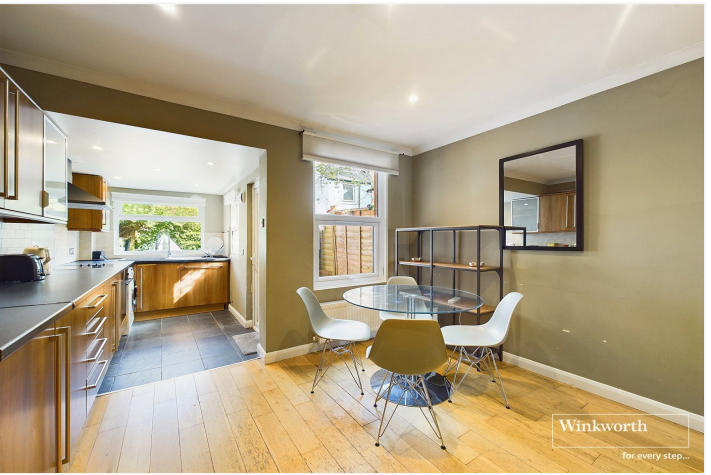
QUEENS COTTAGES, READING, RG1 4BE OFFERS IN EXCESS OF £350,000 FREEHOLD