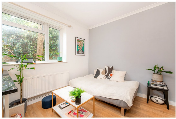
BREWSTER GARDENS, W10 £320,000 LEASEHOLD