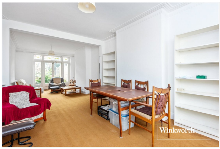
CHURCH CRESCENT, CHURCH END, FINCHLEY, LONDON, N3 £1,200,000 FREEHOLD