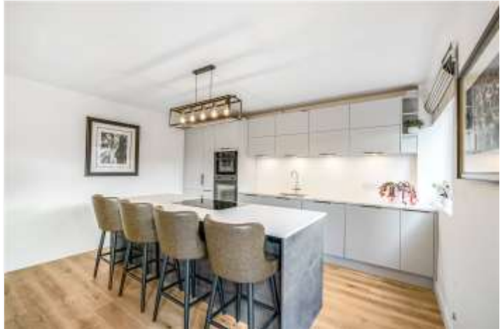
APOLLO HOUSE, BROADLANDS ROAD N6 £735,000 SHARE OF FREEHOLD

A PERFECT HOME IN WHICH TO UPSIZE OR DOWNSIZE IN THE SHAPE OF THIS OUTSTANDING TWO BEDROOM APARTMENT ON THE THIRD FLOOR OF THIS SMALL, LIFT-SERVICED APARTMENT BLOCK IN A PRIME HIGHGATE LOCATION.