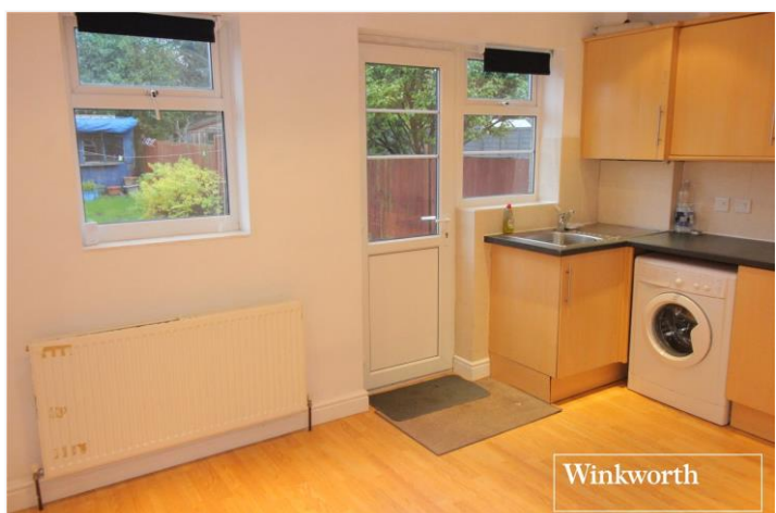
BULLHEAD ROAD, HERTFORDSHIRE, WD6 £1,950 PER MONTH UNFURNISHED