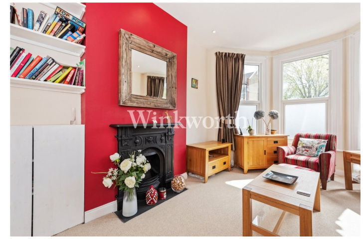
FALKLAND ROAD, LONDON, N8 £525,000 SHARE OF FREEHOLD