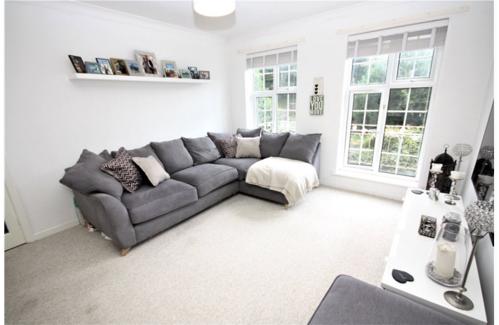
BALMORAL HOUSE, SUFFOLK ROAD SOUTH, BOURNEMOUTH, DORSET, BH2