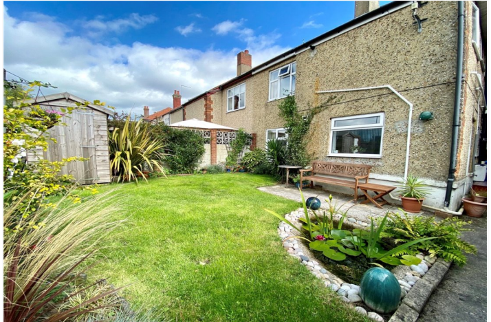
CROMER ROAD, POOLE, BH12