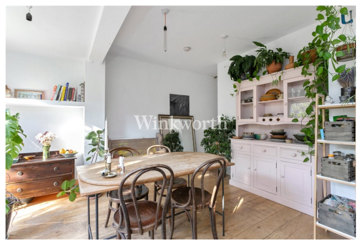
MOUNT PLEASANT ROAD, N17 £500,000 SHARE OF FREEHOLD